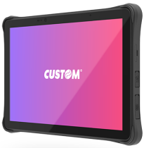
93DHN015900L33 RUGGED TABLET T-RANGER 10.1" ANDR 11 US

Via Berettine, 2 - 43010 Fontevivo PR - P. IVA: IT02498250345 - TEL: +39 0521 680111 - FAX: +39 0521 610701 - CÓDIGO UNÍVOCO: 8RQN7AZ