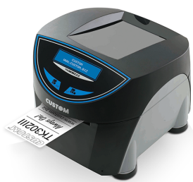
911BB070300713 PRINTER TK302III ETH USB RS232 AVIATION