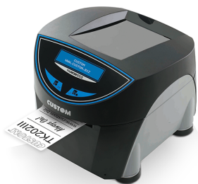
911BD070100313 PRINTER TK202III RFID UHF USB RS232 AVIATION