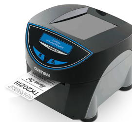
911BD050300313 PRINTER TK202III USB RS232 AVIATION