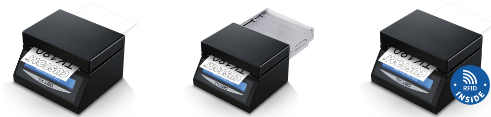
911HL010400733 PRINTER TK180 METAL USB RS232 AVIATION