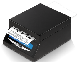
911HL011200733 PRINTER TK180 METAL ETH USB RS232 CUTTER