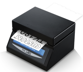
911HL010100733 PRINTER TK180 METAL ETH USB RS232