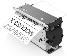
915LF020200300 PRINTER MODUS3 X USB RS232 COMPACT