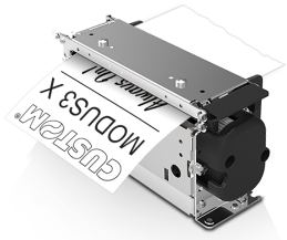
915LF020200300 PRINTER MODUS3 X USB RS232 COMPACT