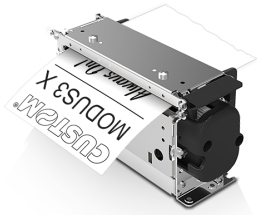
915LF020200300 PRINTER MODUS3 X USB RS232 COMPACT