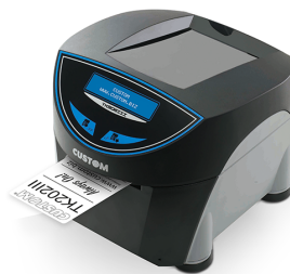
911BD050300313 PRINTER TK202III USB RS232 AVIATION