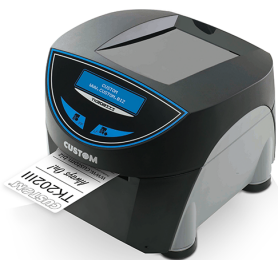
911BD070100313 PRINTER TK202III RFID UHF USB RS232 AVIATION

Via I. Newton, 4 - 43010 Fontevivo PR - VAT: IT02498250345 - TEL: +39 0521 680111 - FAX: - UNIQUE CODE: 8RQN7AZ