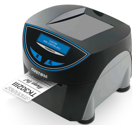
911BB090300713 PRINTER TK302III RFID UHF ETH USB RS232 AVIATION