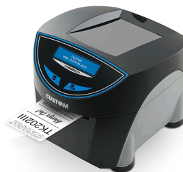
911BD050300313 PRINTER TK202III USB RS232 AVIATION