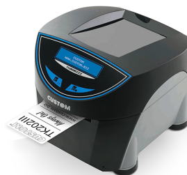
911BD050300313 PRINTER TK202III USB RS232 AVIATION