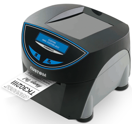
911BB070300713 PRINTER TK302III ETH USB RS232 AVIATION