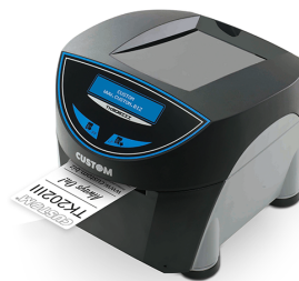
911BD050300313 PRINTER TK202III USB RS232 AVIATION