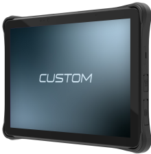
93DHN015900L33 RUGGED TABLET T-RANGER 10.1" ANDR 11 US

Via Berettine, 2 - 43010 Fontevivo PR - VAT: IT02498250345 - TEL: +39 0521 680111 - FAX: +39 0521 610701 - UNIQUE CODE: 8RQN7AZ