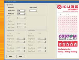
CardSet software tool to understand your coupons

X KUBE SCANNER can recognize automatically the coupon type and any combination, of checks made. Detected checks are then sent to the PC or to POS system, all without additional OCR processing.