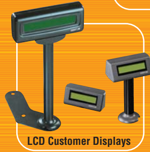
LCD Customer Displays