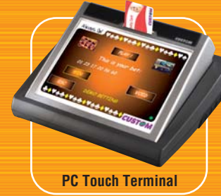
PC Touch Terminal

X KUBE LOTTERY is the high performance printer suitable for lottery applications. Huge paper roll with high autonomy (152 mm diameter) and possibility to stack a very high number of tickets (even more than 25 per session), with paper thickness 65-100µm, are some features just developed for lottery requirements.