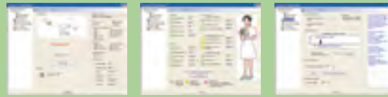
FULL STATUS MONITOR