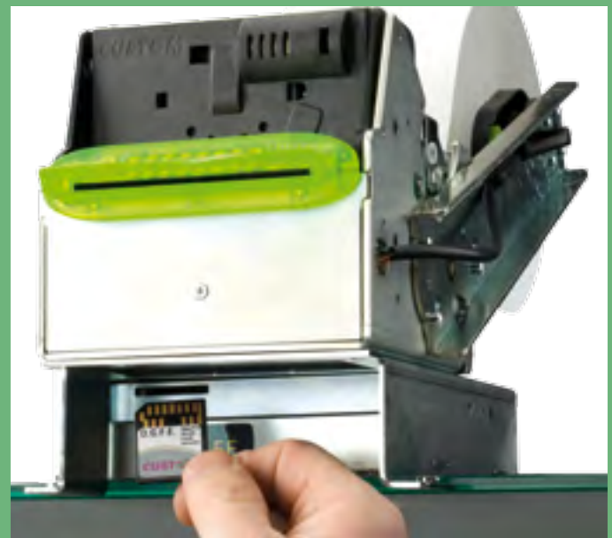
FISCAL VERSION WITH ELECTRONIC JOURNAL