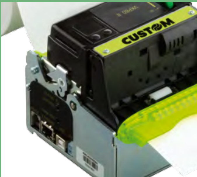
ETHERNET VERSION WITH WEB SERVER