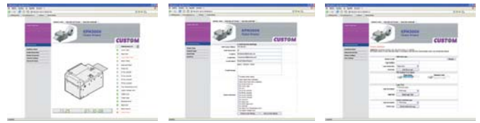
Real Time Status Monitor